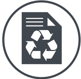
WASTE MANAGEMENT PLANS

Talis recognises the importance of planning for the future and advancing waste management systems to resource recovery programs. This can be challenging in the ever evolving waste industry, however Talis specialises in devising tailored solutions for each of our clients to move towards a more circular economy. Waste awareness and education is fundamental to the successful implementation of resource recovery strategies, along with monitoring through waste data gathering and reporting frameworks.