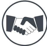
CONTRACTS AND PROCUREMENT