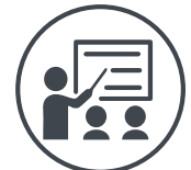
EDUCATION & ENGAGEMENT