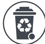
WASTE SERVICE REVIEW