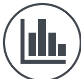
REGULATORY DATA REPORTING